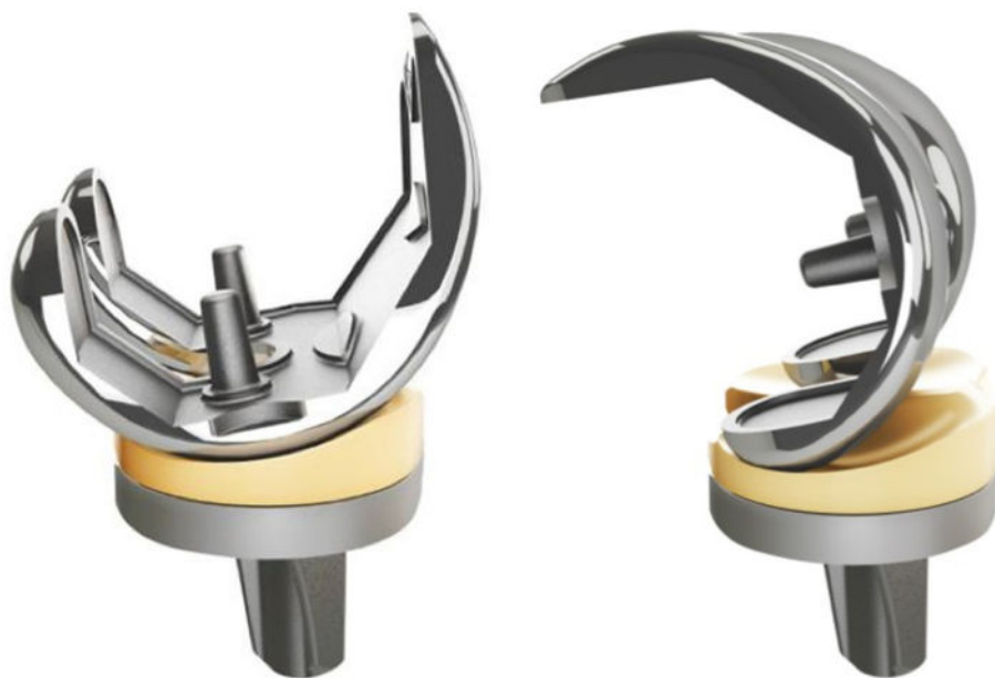
Figure 1. The ACL-substituting TKA design incorporates a lateral tibiofemoral compartment that is spherically conforming in extension, which becomes progressively more lax in flexion to allow the condyle to translate posteriorly.

The remaining 183 dual-pivot knees were matched based on age, body mass index (BMI), sex, and American Society of Anesthesiology Physical Classification (ASA PS) score to 183 traditional primary TKAs with non-conforming polyethylene bearings (traditional non-conforming TKAs; Triathlon®, Stryker Orthopedics, Mahwah, NJ) performed between November 7, 2011 and July 18, 2016. Identical exclusion criteria were used for traditional non-conforming knees and were not considered for matching. Traditional non-conforming knees were cruciate substituting but the posterior cruciate ligament (PCL) was routinely preserved in all patients and an anterior lipped polyethylene component was used. The dual-pivot TKAs utilized cruciate retaining bearings, in